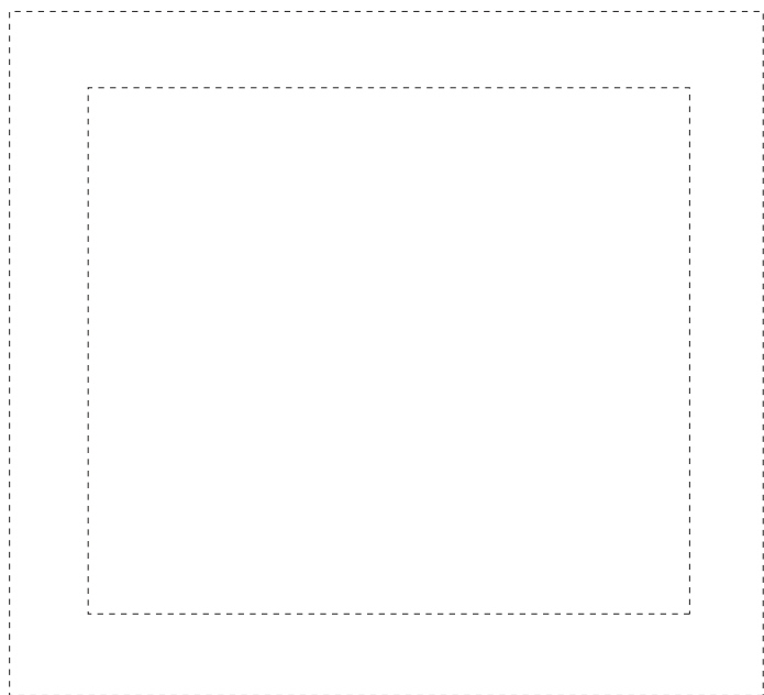
Blank Outlet Covers